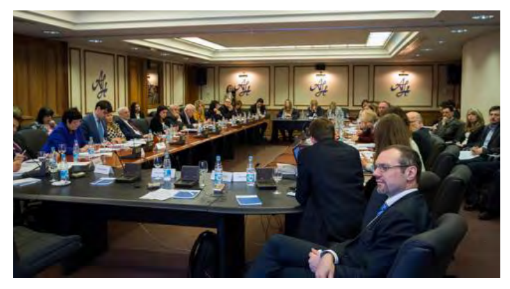
Photo: Participants to the seminar of the Russian International Affairs Council «Higher education for greater Europe».

On 10 February, the Delegation of the European Union to the Russian Federation took part in a seminar organised by the Russian International Affairs Council (a non-profit academic and diplomatic think tank founded by the Russian Ministry of Foreign Affairs and the Ministry of Education and Science in 2010) devoted to academic cooperation between Russia and Europe. The event was for the heads of Russian universities – members and partners of the Council (around 20 leading universities). The EU Delegation took the opportunity to increase its outreach and to promote the possibilities of increasing the participation of Russian universities in EU higher education and research & innovation programmes, in particular through Horizon 2020 and the Erasmus Plus programme.