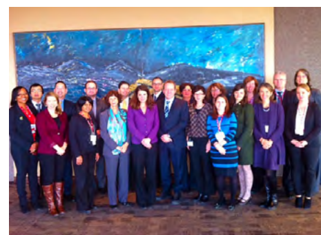
Photo: Participants to the JSTCC meeting in Ottawa

The JSTCC discussions also focused on Framework conditions for cooperation between both sides. The support project ERA-CAN Plus is planning to compile an overview of the Framework conditions for cooperation, including the Canadian funds offered in various areas of cooperation such as those existing in Canadian provinces. The ERA-CAN Plus project has already established a vast National Contact Point network in Canada and organised country-wide Horizon 2020 info sessions in all Canadian provinces. Further information exchange took place on existing and future cooperation opportunities related to research infrastructure activities and the activities of the Canadian Manufacturers & Exporters (CME) association as member of the Enterprise Europe Network (EEN).