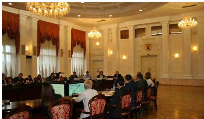
Photo: Participants to the information seminar of the European Information Consulting Centre in Russia

On 23-24 October 2014, the Russian Agency for the Support of Small and Medium Business (RA) and the Russian Ministry of Economic Development held a training seminar for representatives of the regional network of the European Information Consulting Centre in Russia. The Centre is operated by the RA, which is one of the leading organisations in Russia working to support the development and activities of small and medium business and a member of the Gate2RuBIN project consortium. The Gate2RuBIN initiative («Gate to Russian Business and Innovation Networks») started in 2008 under the EU's Competitiveness and Innovation Programme with the purpose of integrating Russia into the Enterprise Europe Network. The activities of the project consortium include support for Russian SMEs participation in the EU's Framework Programmes for research and innovation, including through their established network of so-called Regional Integrated Centres. As part of the training programme of the seminar the EU Delegation to Russia made a presentation and distributed information materials on the Horizon 2020 programme to the representatives of these Centres.