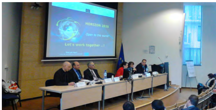
Photo: speakers at the International NCPs workshop

The workshop was organized in Brussels on 26 November by the International Cooperation Directorate (C.3) and the INCONTACT 2020 project which promotes the capacity building, coordination and networking of all National Focal Points for International Cooperation. The workshop aimed to highlight the global dimension of Horizon 2020 and to facilitate the exchange of views for the enhancement of international research cooperation. The Workshop brought together the National Contact Points (NCPs) of International Partner Countries, EU Member States, Associated countries NCPs involved in international cooperation activities, and European Commission officials in order to discuss ways to improve international participation in the new Framework Programme. The objectives of this workshop were two-fold: first, to explain and discuss the main features of International Cooperation in Horizon 2020 including the implementation of the International Cooperation Strategy, and second, to show support to NCPs, listen to their comments, identify best practices, and help them address various challenges such as forging better links between NCPs in the International Partner Countries and NCPs in the Member States and Associated Countries and allowing International Partner Country NCPs to receive faster and better information from the European Commission. The report of the workshop will be ready in December.