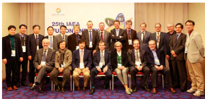
Photo: Participants to the 4 th meeting of the S.Korea-Euratom Coordinating Committee