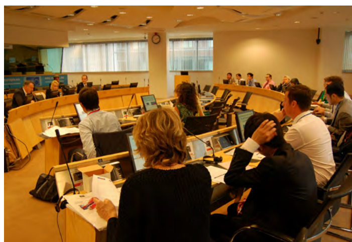
Photo: Participants at the JEUPISTE Innovation Workshops