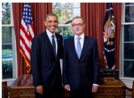
Photo: President Barack Obama and Ambassador David O'Sullivan at a White House ceremony

He represents the Presidents of the European Commission and of the European Council, under the authority of the High Representative for Foreign Affairs and Security Policy.